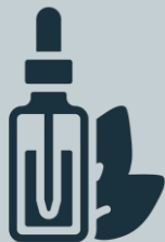
Blue Gum Eucalyptus ( Eucalyptus globus )